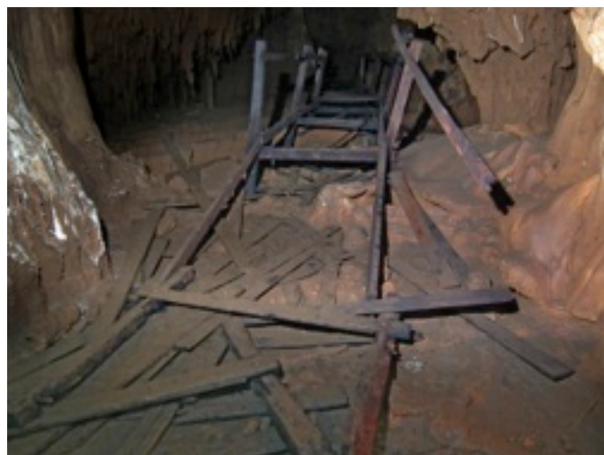
Two views of timber walkways in Gua Mimpie Cave