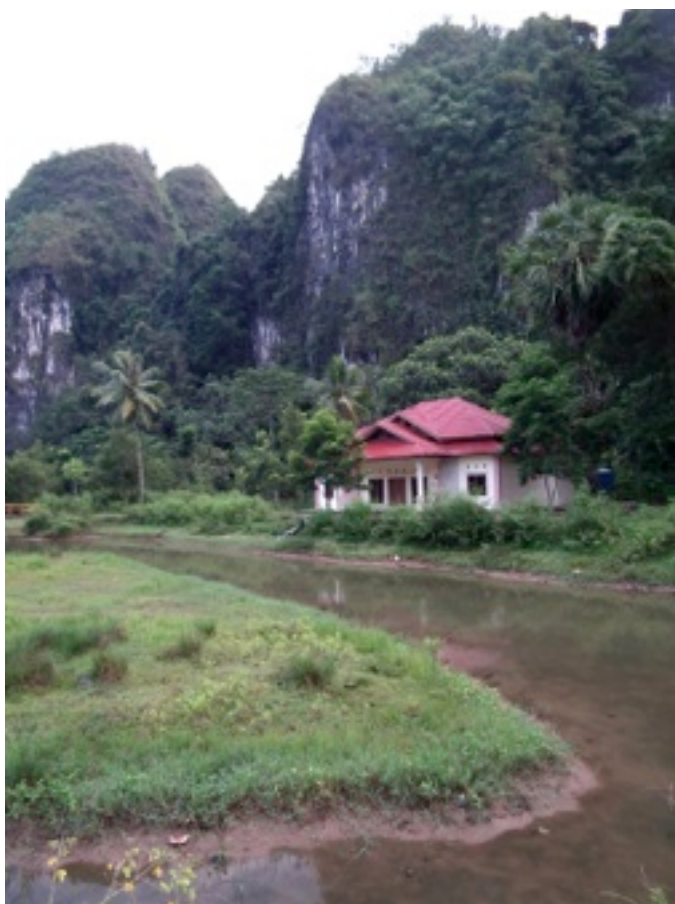
Tower karst in Bantimurung Bulusaraung National Park

A recent caving trip took me to the karst area of Bantimurung Bulusaraung National Park, in the Maros regency, Pangkajene district of South Sulawesi, Indonesia. The nearest commercial Airport is at Maros, just under an hour's drive from the National Park. In the other direction (South) from the airport is the major city of Makassar where most essential supplies can be purchased. Bantimurung National Park (NP) is 43,750 hectares in area and 45 kilometres to the north of Makassar. It contains the limestone tower karst of Maros Pangkep, the second largest tower karst area in the world after an area in South-Eastern China.