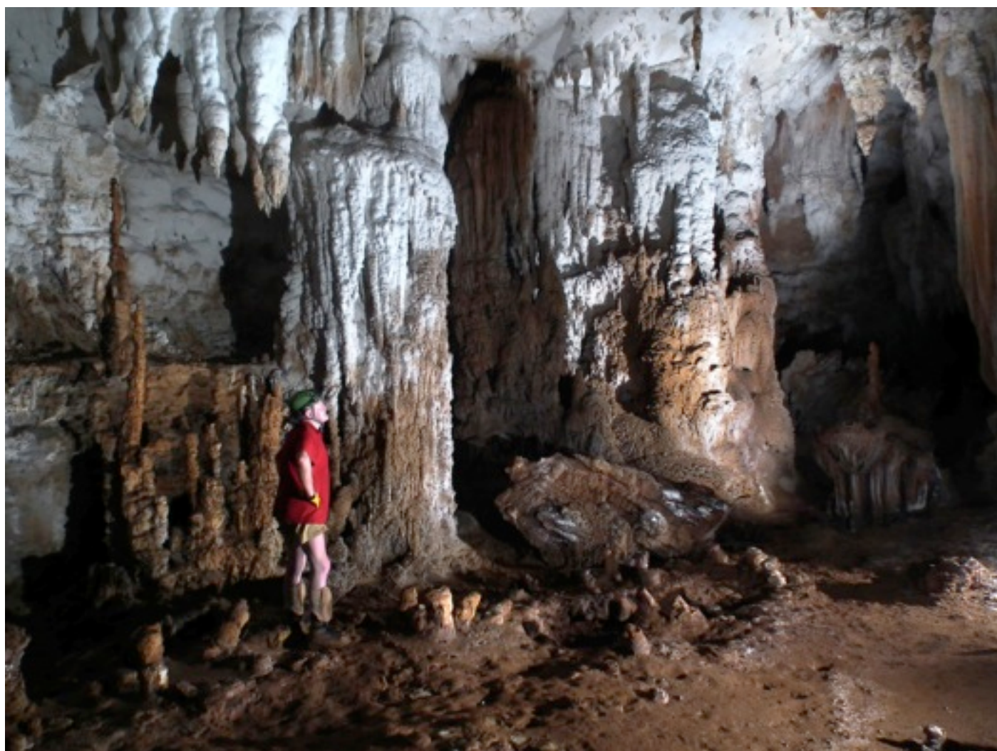
Neil Anderson in Isotona Toakola Cave.

This cave consisted of two poorly decorated chambers with a tacky mud floors. The chambers were connected by a short narrow passage with several wobbly stepping stones to keep visitors' feet out of the ankle deep water. Given that the majority of visitors were Indonesian, who preferred to remove their thongs or shoes and cave in bare feet, the stepping stones made no sense as most people washed their feet instead of using the unstable stones. The temperature underground felt like 27°C and