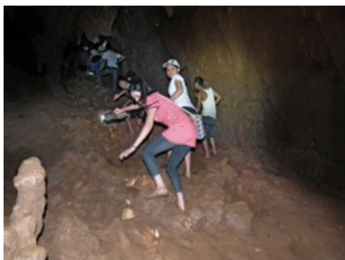
Barefoot tourists in Gua Mimpì Cave.