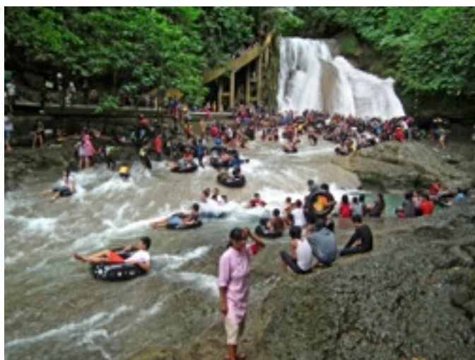
Tufa waterfall packed with people in Bantimurung National Park

Bantimurung NP is a magic place of tower karst, rainforests, tufa waterfalls and caves. While in the area we visited a number of limestone caves which were open to the public. Other caves, not open to tourists, were also visited under permit arrangements, but are not discussed in this article.